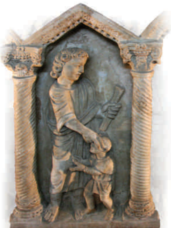
Jesus’s miracles restoring sight to the blind also identified him as the promised Messiah.

Finally, the healing of both physical and spiritual blindness is linked to the work of the promised Messiah. In speaking of the Servant of the Lord, God himself said, “I will keep you and will make you to be a covenant for the people and a light for the Gentiles, to open eyes that are blind” (Isa. 42:6–7). As we read the Gospels, it