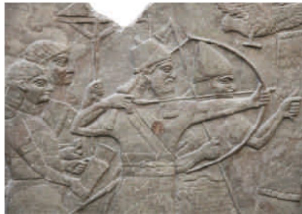
This bow allowed an archer to fire lethal volleys of arrows while remaining safely outside the range of most other ancient weapons.

Apart from target practice, ancient artwork shows and the Bible mentions the shooting of an arrow in two settings: during the hunt and during war (Gen. 27:3; 1 Sam. 31:3; Jer. 50:14). We encounter the latter most frequently in