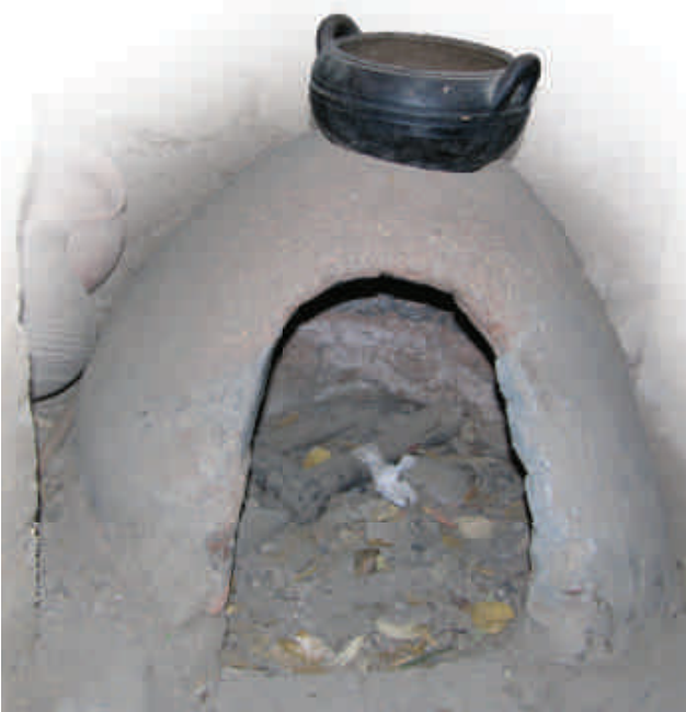
An oven for baking bread was included in the plan of every home.

In contrast to these ordinary instances involving baked goods, we find six instances in which baking or not baking receives special mention because the circumstances were unusual: (1) Moses taught the Israelites that this fundamental task was to be suspended on the Sabbath. Any baked goods eaten on the Lord's Sabbath had to be baked the day before (Exod. 16:23). (2) The normal rhythm of baking was also interrupted by Israel's demand that they be led by a king. Monarchs of Bible times had their own full-time baking staff (Gen. 40:1–2). Consequently, Samuel warned that Israel's request for a change in political structure would result in daughters being removed from their family household and put to work baking daily bread not for their own families but for their king (1 Sam. 8:10–11, 13). (3) The smell of baking bread was as pleasant an aroma in Bible times as it is today. But in at least two instances, these pleasant