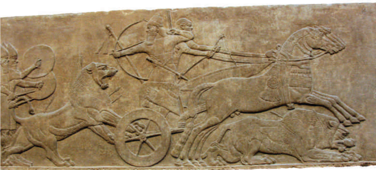
Arrows were used not only in support of a military operation but also when hunting big game.

will win over all opposition. Though this action cannot be commended to our readers for replication, Elisha opened the window of his bedroom and fired an arrow through it. The firing of this arrow represented the victory of God's people over Aram (2 Kings 13:17).