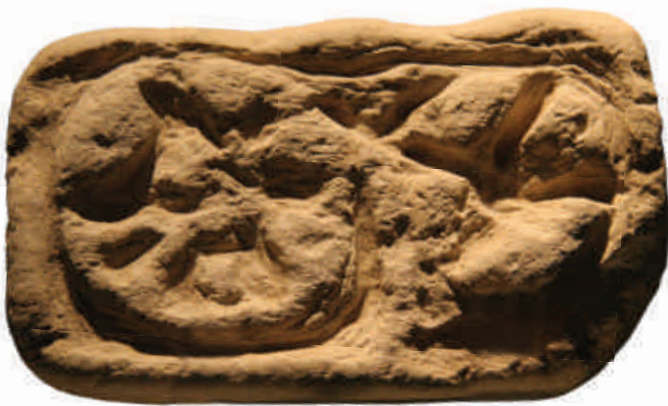
A first-century AD bread stamp used to impress a design into the bread dough before baking.

We can divide the instances in which the biblical authors formally mention the baking of bread into two categories: (1) baking that occurred in ordinary and expected settings, and (2) baking that is noteworthy because it was unusual in some way. We can safely say that no activity was more ordinary in Bible times than the baking of bread. It was done on a daily basis for one's family whether the family was lingering around the family compound or preparing for an extended journey (Exod. 12:39). It was also customary to bake and offer bread to recently arrived guests, who would naturally be hungry after walking a long distance (Gen. 14:18; 18:6; 1 Sam. 28:24). Bread was also baked and brought to the Lord as an offering, honoring the premise that there would be no grain without the blessing of the Lord. This offering could consist of raw grain, but it was more often prepared and presented before the Lord