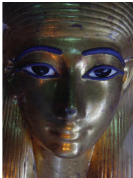
The importance of vision is suggested by the emphatic depiction of the eyes in ancient art.

In addition to the accounts that describe Jesus restoring sight, we also have two instances in which Jesus specifically referred to such healing acts as evidence that he was the Messiah. In the first, John the Baptist’s disciples inquired if Jesus was the one to expect or if they should look for another. In response, Jesus explicitly linked those acts of healing to Isaiah 42 (see Matt. 11:5). In the second, we catch up with Jesus in the synagogue at Nazareth. When it was time for the Scripture reading, he was handed the scroll of the prophet Isaiah and read the portion from Isaiah 61 that describes the Messiah as one who provides “recovery of sight for the blind” (Luke 4:18 TNIV). With healing miracles in his wake, Jesus declared, “Today this scripture is fulfilled in your hearing” (Luke 4:21).