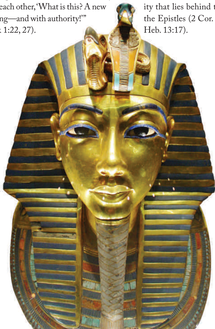
A funeral mask of King Tut’s mummy. Rulers such as King Tut of Egypt often sustained their authority through the use of military power.

While Jesus acknowledged that all authority resides in him, he shared a portion of that authority with his followers, who were charged with advancing the kingdom of God to its ultimate realization. We see this occurring in a limited, local way during Jesus’s time on earth (Luke 9:1; 10:19) and then exploding into an international effort at the time of his ascension. “All authority in heaven and on earth has been given to me. Therefore go and make disciples of all nations” (Matt. 28:18–19). It is this divinely given authority that lies behind the teaching we meet in the Epistles (2 Cor. 10:8; 13:10; Titus 2:15; Heb. 13:17).