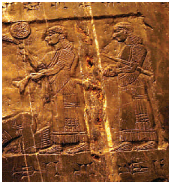
The long belts of royal officials added style and distinction to an otherwise ordinary piece of apparel.

Finally, we see the intimate relationship between belt and owner used in two metaphors in which the belt symbolizes a quality that is as closely linked to a person as the belt is linked to the one who wears it. Isaiah described the Messiah in this way: “Righteousness will be his belt and faithfulness the sash around his waist” (Isa. 11:5). And Paul encouraged us all