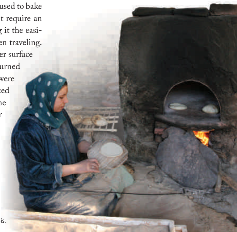
Bread was baked on a daily basis.

built around the exterior of the tabun heated the interior of the oven, and the temperature was controlled by adjusting the lid that fully or partially closed the opening on top of the beehive. Stones placed on the floor of the tabun became the baking surface on which the dough was placed. The third method for baking bread was also in an oven. This one was called the tannûr , and it was also shaped like a beehive. But in the tannûr the fire was built inside the oven and the bread dough was slapped on the curved sides of the oven to bake. 3