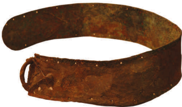
Most people wore belts made from cloth, so a belt made of bronze helped distinguish this belt’s wearer as a warrior.

to have our lives so intimately linked to truth that we walk with the “belt of truth buckled around [our] waist” (Eph. 6:14).