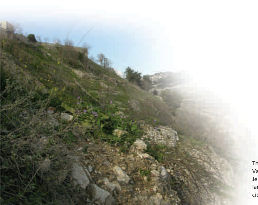
The steep climb from the Kidron Valley to the ridge (left) led the Jebusites to boast that even the lame and blind could defend their city against David (2 Sam. 5:6).