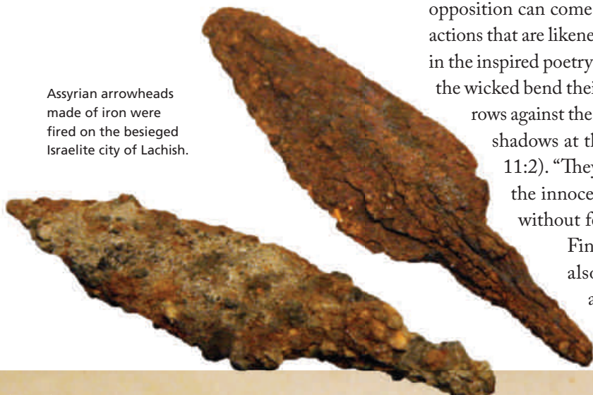
Assyrian arrowheads made of iron were fired on the besieged Israelite city of Lachish.

Finally, it is the Lord who also shoots metaphorical arrows that are emblematic of the victory he