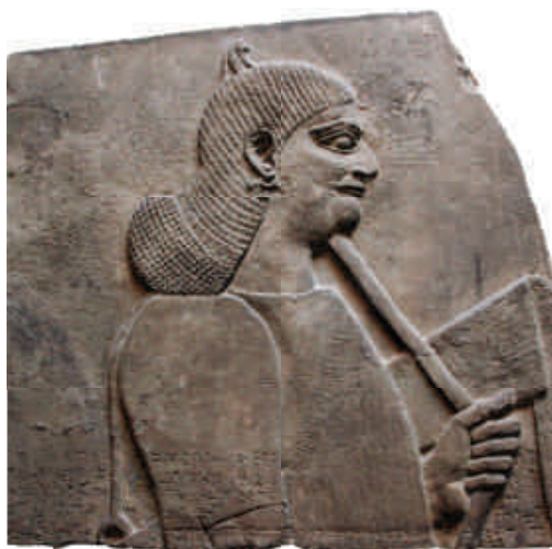
An Assyrian armor-bearer.

When Saul asked his armor-bearer to kill him on the heights of Mount Gilboa (below), he linked his failed rule to that of Abimelek, who had made a similar request.