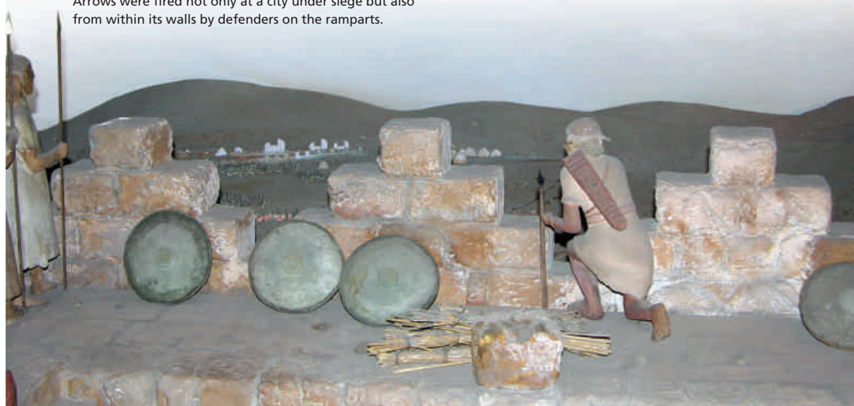
Arrows were fired not only at a city under siege but also from within its walls by defenders on the ramparts.

Arrows shot by an unseen divine hand are even more effective than literal arrows in taking out opposition to God's people and his kingdom. "But God will shoot them with his arrows; they will suddenly be struck down" (Ps. 64:7; see also 144:6 and 2 Sam. 22:15).