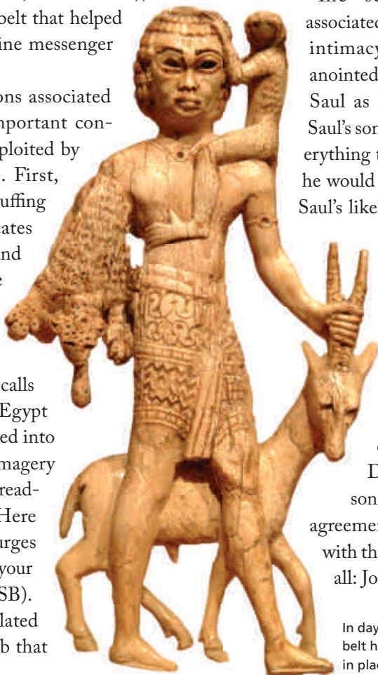
In days without elastic or Velcro, a belt held a loose-fitting garment in place around the waist.

The second connotation associated with the belt is great intimacy. When David was anointed by Samuel to succeed Saul as king of Israel, it was Saul's son Jonathan who had everything to lose politically since he would have been regarded as Saul's likely successor. Our concerns over competition for the throne are removed as we observe David and Jonathan making a covenant in which Jonathan affirmed David as Saul's successor. 6 Jonathan gave David a variety of personal items to confirm this agreement. The list terminates with the most intimate item of all: Jonathan's belt. Intimacy