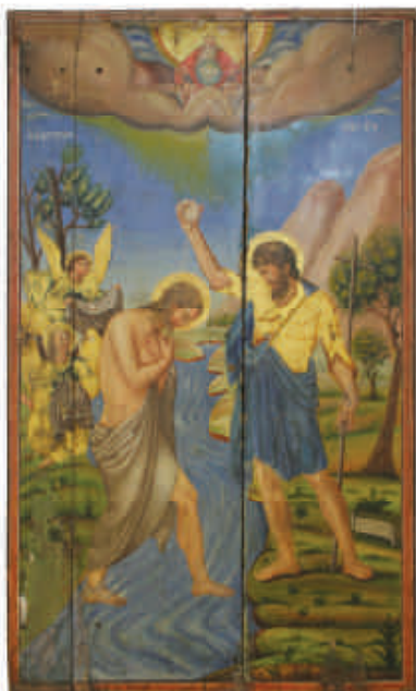
At Jesus’s baptism, God the Father declared that his Son had full authority to speak for him.

A revolving set of empires would give way to the establishment of an eternal kingdom led by one unique figure. The Ancient of Days would give this man authority to rule an empire that would include “all the peoples, nations and men of every language,” a kingdom that “will not pass away; and . . . will not be destroyed” (NASB). Jesus did not have to attach himself to a rabbinic school to obtain authorization to teach because he was ordained, so to speak, in a very unusual ceremony on the