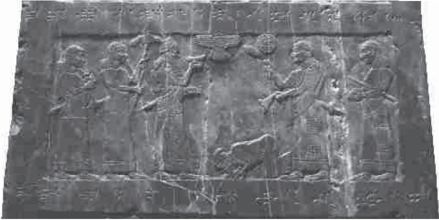
Figure 1.2. A first-millennium-BC Neo-Assyrian image of homage

envision a day when all kings and nations will prostrate themselves before YHWH. Indeed, poets even speak of heavenly creatures as worshiping before him (Pss. 29:1–2; 97:7). Note especially Nehemiah 9:6: