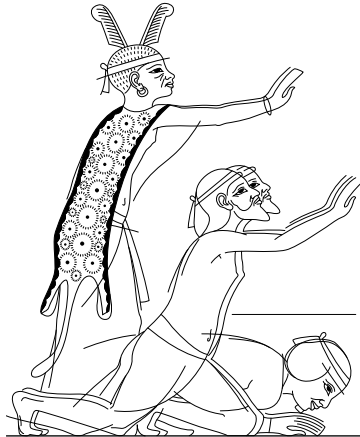
Figure 1.1. A second-millennium-BC Egyptian image of homage on limestone from the necropolis at Thebes

The prostration expressed by hištaḥāwā and other similar words was not limited to the worship of the Deity. In the ancient world and many cultures today, lower-class individuals would customarily prostrate before social, economic, and political superiors. 41